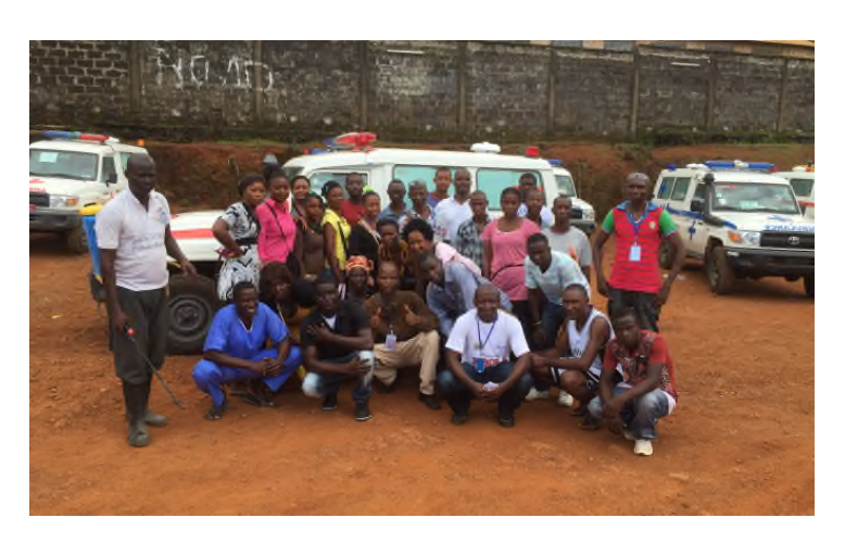
The Ambulance Service of Sierra Leone The "Ebola Warriors"